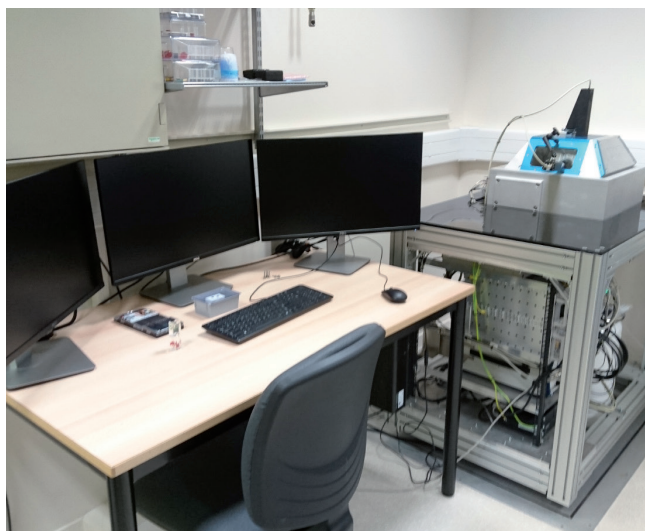
Fig. 1: Nanoscan VLS-80 microscope installed at the NEEL open AFM facility.